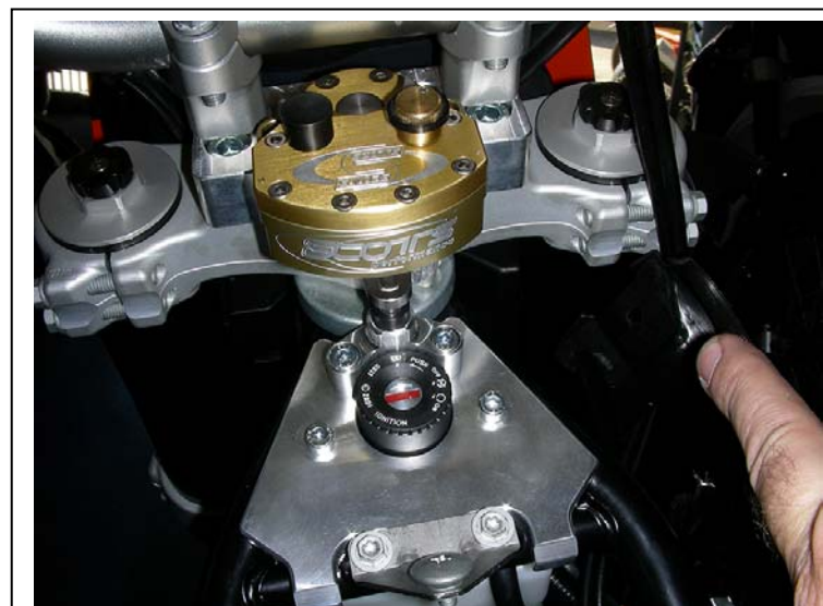
Parts are silver in this photo to show contrast for mounting ease.